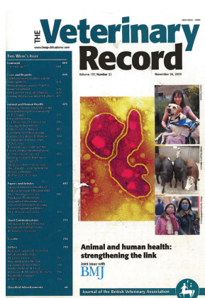
In 2005 The Veterinary Record and BMJ published an influential joint issue on the theme of 'one medicine'