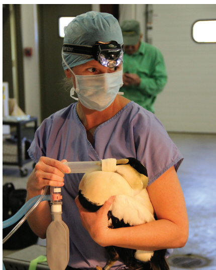
Interest in avian influenza led to the recognition that One Health had a wider application. Here, a veterinarian anaesthetises a common eider duck before surgically placing a satellite transmitter to track migratory patterns and assess the zoonotic potential of Wellfleet Bay virus

While the coordinated international response to influenza remains the poster child of One Health in action, other disease control programmes that do not have the high public profile of influenza have benefited by receiving greater attention and financial support. The integrated control and prevention of endemic zoonoses in developing countries is one such area.