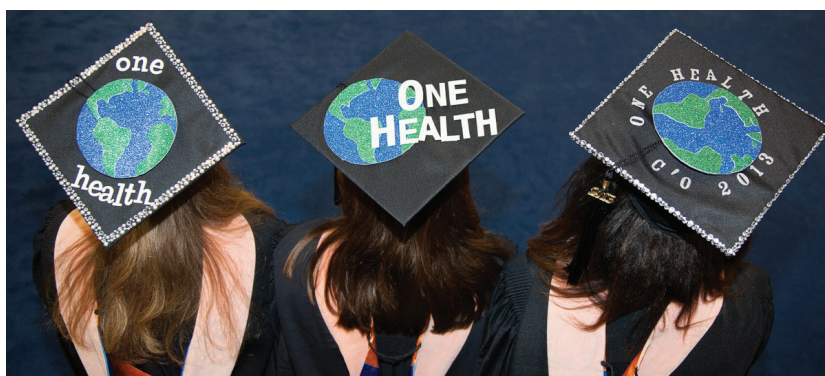
Graduates from the University of Florida highlight the subject of their masters degree at their graduation ceremony in December 2013

In 2011, the Association of American Veterinary Colleges addressed the issue when it published a Roadmap for Veterinary Medical Education in the 21st Century. In this roadmap it recommended that all veterinary students achieve competency before graduation in three main areas: multispecies knowledge plus clinical competence in one or more species or disciplines; One Health competency related