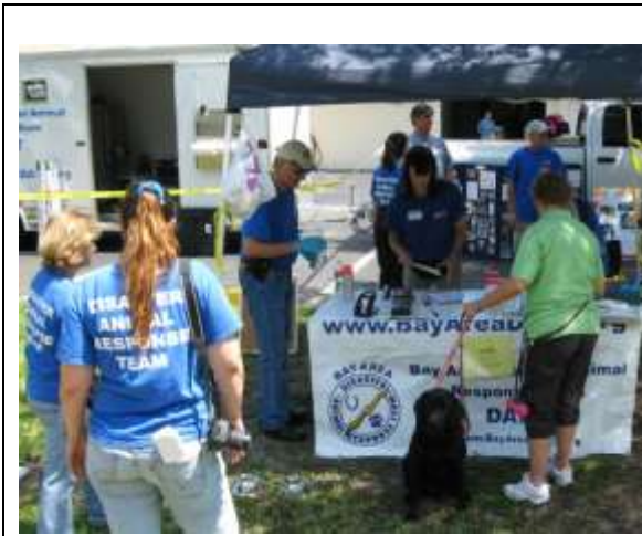
Patient check-in at Bay Area DART intake