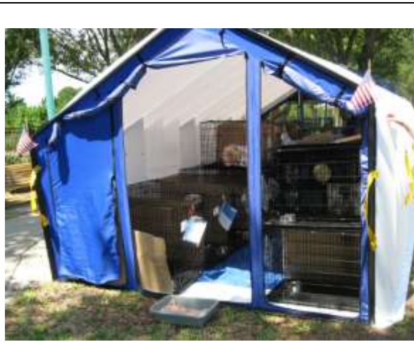
VETS tent manned by DART volunteers