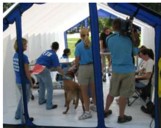
VETS, clinicians and DART Team members perform medical assessments