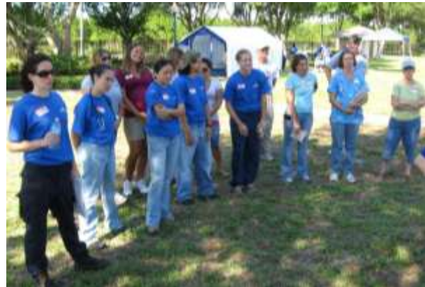
VETS & Vet Corps staff, students and technicians