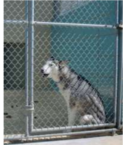
The Hurricane Suiter exercise tested, on paper, the state's ability to accommodate animal issues. It did not test agricultural subjects such as flooding of Florida's vast areas of vegetable, fruit, and sugar cane.

No final Hurricane Suiter report or evaluation is available, but several web sites have performed interim and background reporting: http://www.northescambia.com/?p=8643 and http://maxmayfieldshurricaneblog.wordpress.com/2009/06/04/you-play-like-you-practice/ .