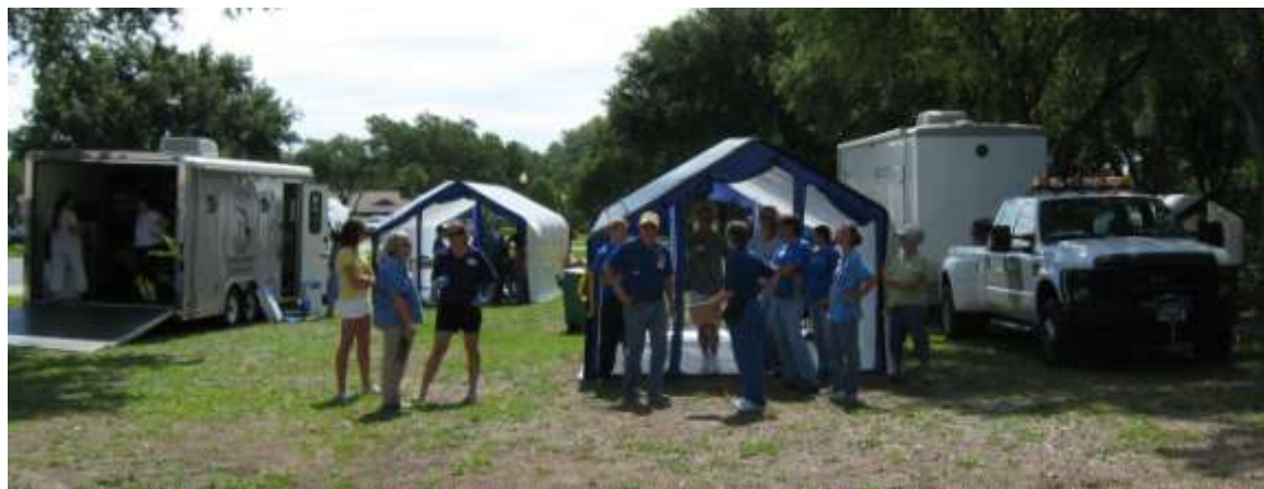
VETS & VET CORPS Compound prepares to receive animals for medical assessment at SEG D