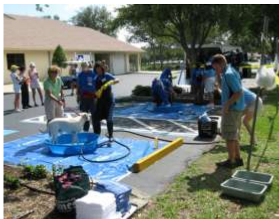
VET CORPS Compound prepares to receive the first animals for medical assessment