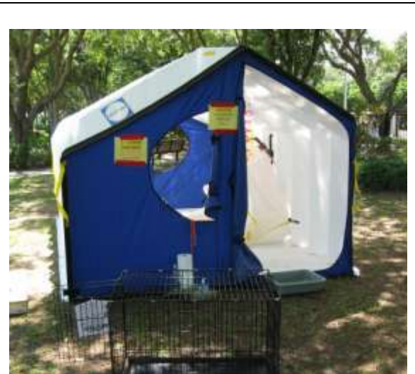
The Bio-Isolation facility for the exercise uses a VETS tent