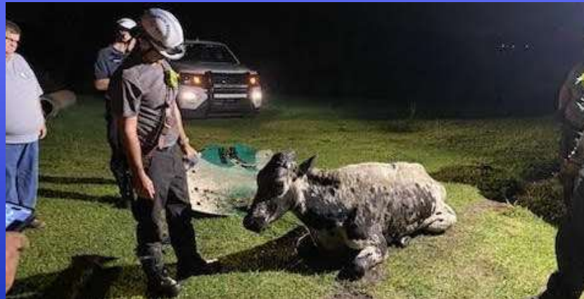
March 2023 Cow retrieved from mud by Pasco County Fire & Lakeland Fire