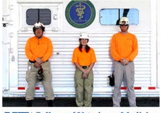
UF College of Veterinary Medicine UNIVERSITY of FLORIDA

This course, a collaboration of the UF College of Veterinary Medicine, and UF IFAS, and hosted through the UF Distance Education Center, meets all of the National Fire Protection Association standards for large and small animal technical rescue. The NFPA standards are the learning objectives for the course, and addresses ICS