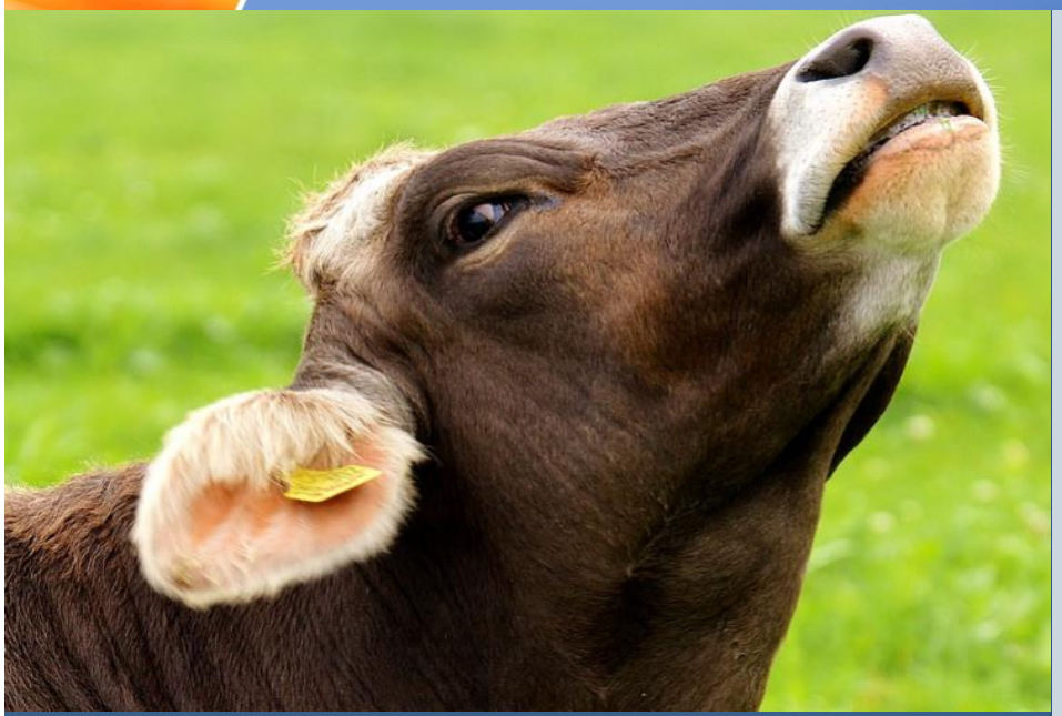
The Florida State Agricultural Response Team is working to meet the agroterrorism planning and response needs of the State.

Newsletter of the Florida State Agricultural Response Team