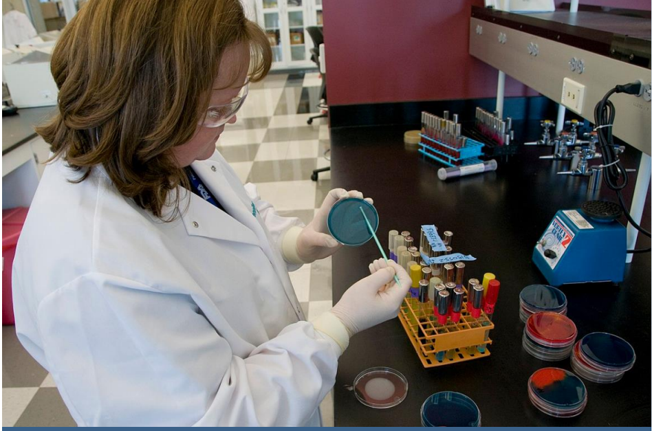
US Food and Drug Administration scientist tests for presence of Salmonella

Newsletter of the Florida State Agricultural Response Team