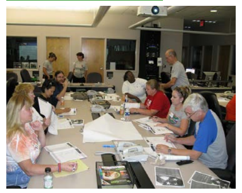
With more than 1300 trained volunteers, SARC has deployed more than 500 people to help other agencies or to participate in training exercises and workshops.

SARC presented its <u>Awareness Level</u> Small Animal Emergency Sheltering training a dozen times in Florida. Hundreds of students took the first step to becoming competent animal disaster responders. Several students traveled from other states, with the goal of taking SARC practices and protocols back to their communities.