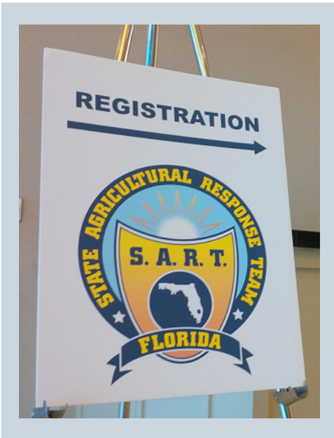
148 members attended the 2015 SART Planning Meeting.