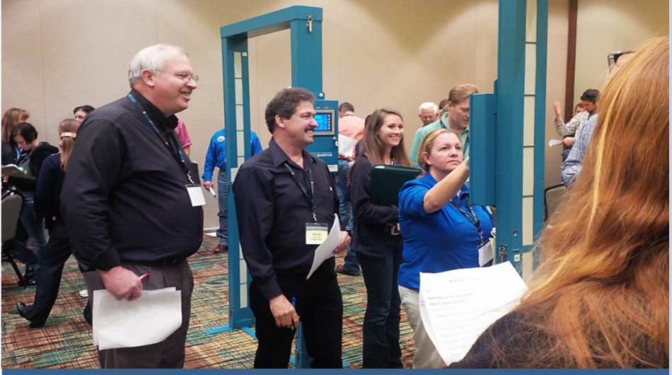
SART members engaging in a radiological exercise during the 2015 Planning Meeting.