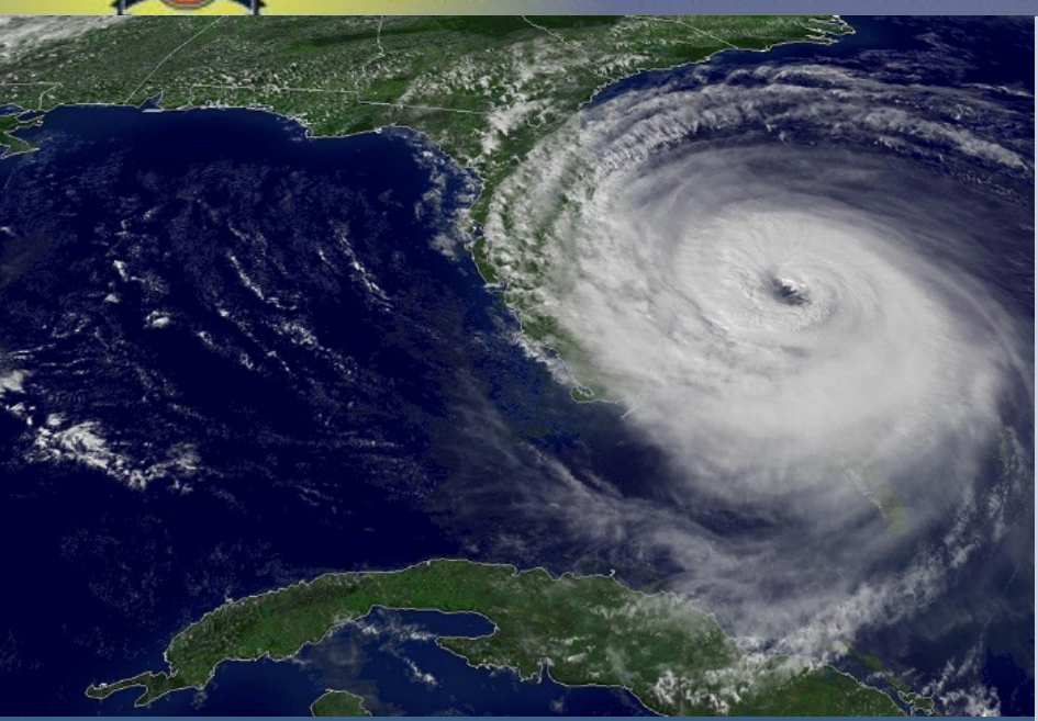
June 1 marks the official start of the 2015 Hurricane Season.

NEWSLETTER OF THE FLORIDA STATE AGRICULTURAL RESPONSE TEAM