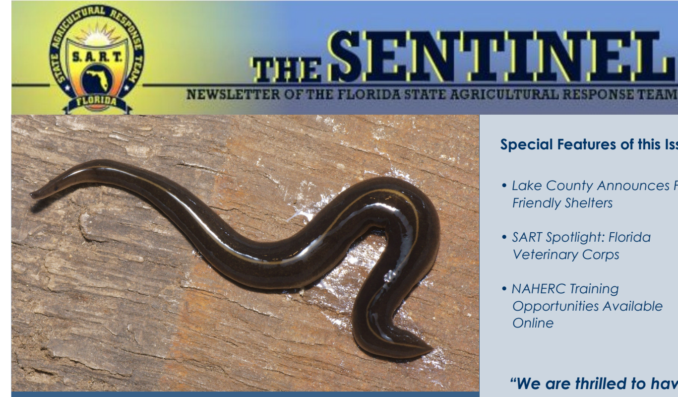
Platydemus manokwari, also known as the New Guinea flatworm, is a species of large predatory land flatworm.