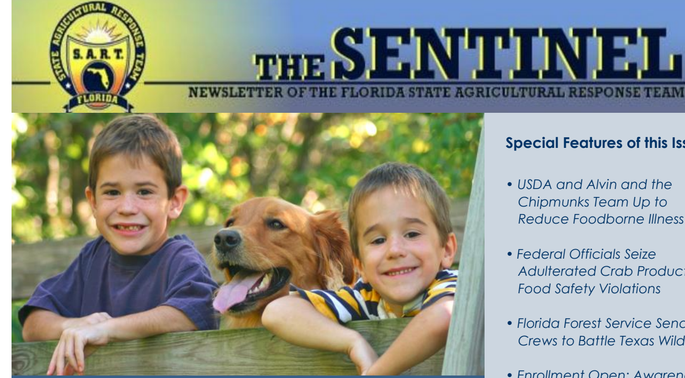
The CDC has recently unveiled a new Website that advises readers about the diseases people can catch from pets, farm animals, and wildlife.