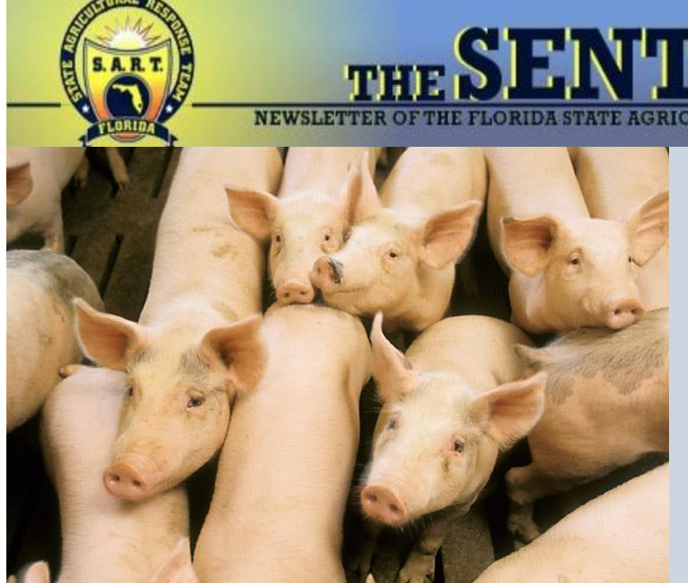
ARS discoveries are providing vital information to help fight this economically devastating disease, which affects cattle and other cloven-hoofed animals.