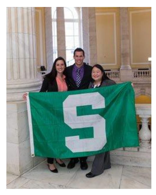
Students from around the country will bring their pride to the nation's capital.

The American Veterinary Medical Association (AVMA) Governmental Relations Division is teaming up with SAVMA to host a joint 2016 legislative fly-in that will bring veterinary students and veterinarians to Washington, D.C., to participate in a two-day workshop. The 8th AVMA Legislative Fly-In will take place Feb. 28- March 1 in Washington, D.C.