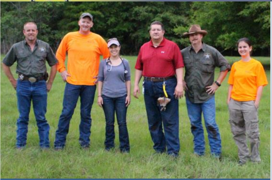
Rescuers pose for a quick photo following the rescue of a 3-day old calf on April 13, 2016.

NEWSLETTER OF THE FLORIDA STATE AGRICULTURAL RESPONSE TEAM