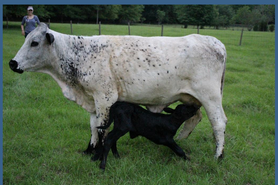
Above: All's well that ends well.