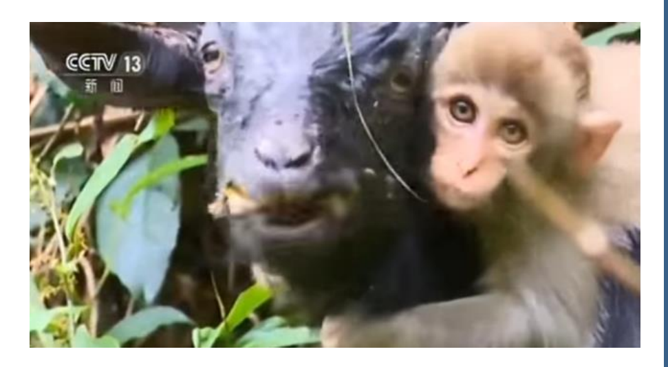
All together now... Aaawww!

As reported on <u>the news site UPI</u>, a baby monkey formed an unexpected bond with a herd of goats in China. In a video from CCTV 13 posted on <u>YouTube</u>, the young monkey is seen riding the backs of goats as they forage for food.